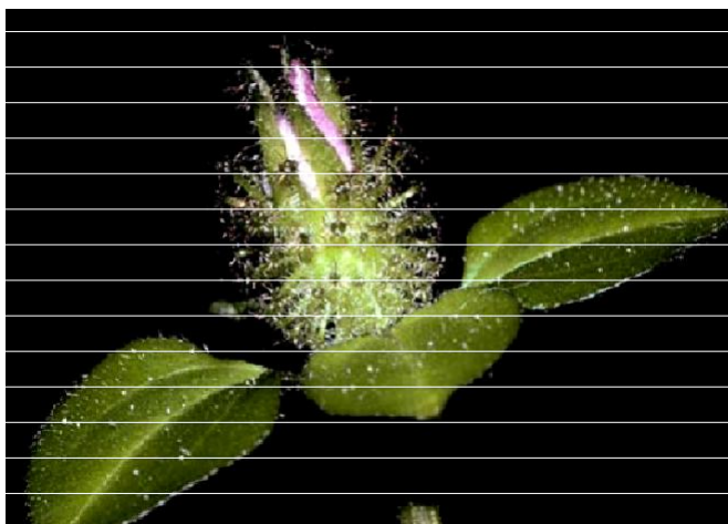
Figure 1. DISSOTIS ROTUNDIFOLIA Triana.