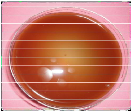
Figure 3. Effect (20%) of cold water extract of Indian Costus on the growth of Kelbsilla pneumonia bacteria.