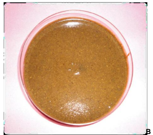
Figure 2. Effect of Sea-Qust on the growth of Staphylococcus aureus bacteria. (A): Control culture. (B): S. aureus culture with 15% Sea-Qust powder.