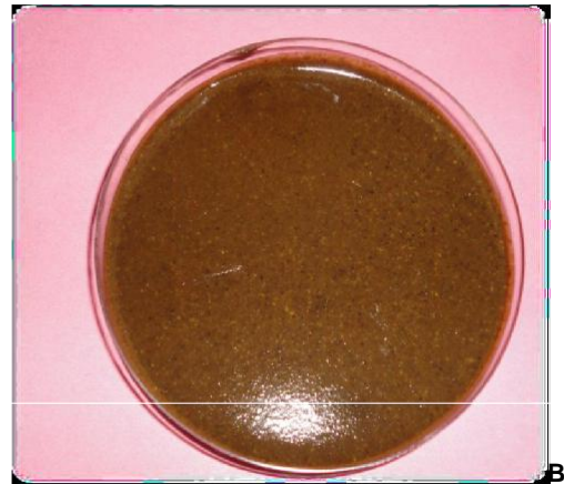
Figure 1. Effect of Indian Costus on the growth of Kelbsilla pneumonia bacteria. (A): Control culture; (B): K. pneumonia culture with 20% of Indian Costus powder.