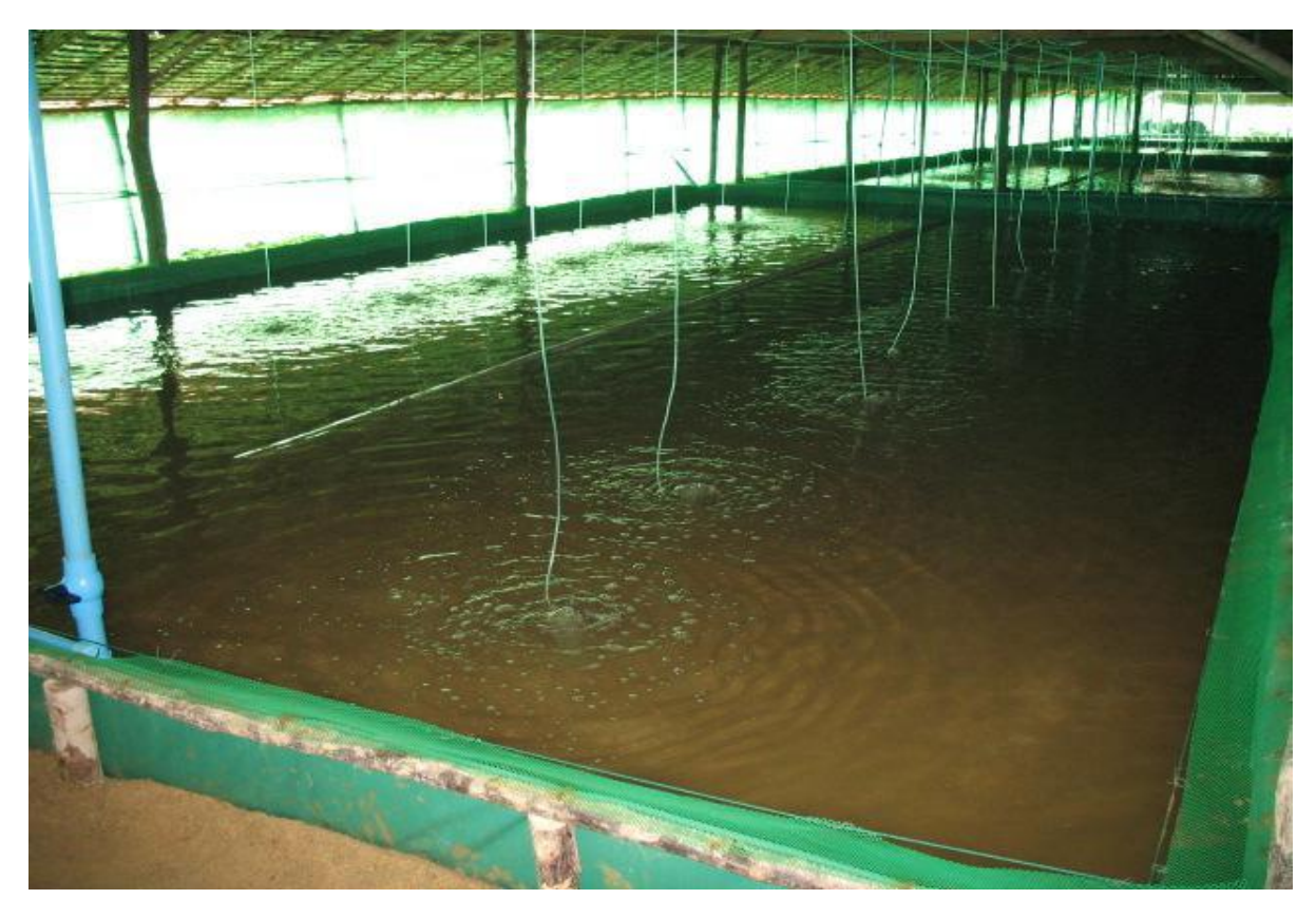
Figure 1. Grow out of B. areolata to marketable sizes using large-scale flow-through canvas ponds of 6.0x12.0x0.4 m.