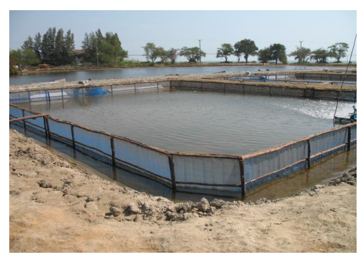
Figure 2. Grow out of B. areolata to marketable sizes using large-scale earthen ponds of 20.0x19.0x1.2 m.