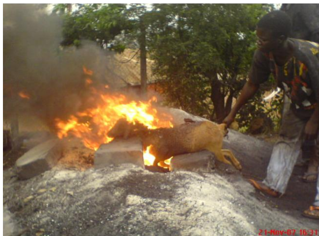
Figure 3. Singeing of goat in open fire fuelled with scrap tyres

Products Order, 1973). Thus, prior to singeing with the scrap tyres, the hides were already contaminated with unacceptable levels of Cd, Zn and Pb. This might be reflecting undue levels of heavy metal exposure in the local environment. The animals could potentially have picked heavy metals from the environment given the challenges of free-range grazing, scavenging in open waste dumps for fodder, drinking water from polluted drains and streams and exposure to atmospheric depositions especially from automobile fumes and open burning of solid waste. Indeed, close correlation have been reported between heavy metals concentration in cattle tissues with that in soil, feed, and drinking water (Qiu et al., 2008). Generally, toxic heavy metals such as Pb and Cd have slow rate of elimination such that harmful levels could accumulate in tissues after prolong exposure to even low quantities in the environment (Humphreys, 1991; Sharma et al. 1982; Doyle and Spaulding, 1978). The un-singed hides have levels of Cu falling within permissible limit of 20.0 mg/kg (Meat Food Products Order, 1973). With regards to Mg, Mn and Ni, it is unclear whether the background levels recorded in the hides may constitute significant problem to meat consumers; this is because of their role as essential heavy metals. As contaminants however, no MPL have been fixed for them in meat.