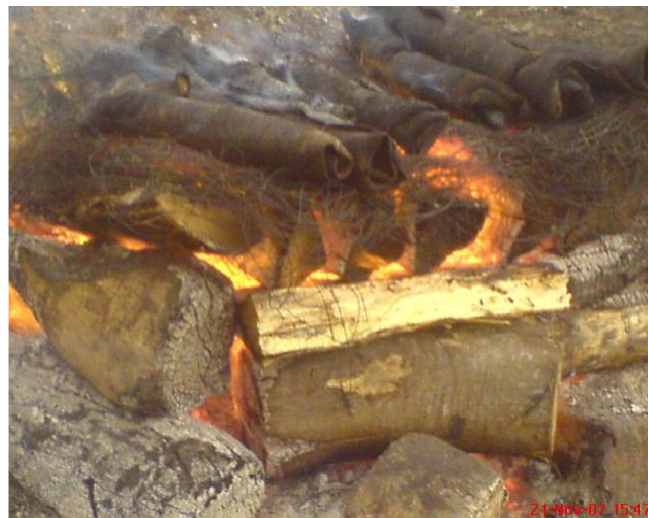
Figure 4. Singeing of cattle hides placed directly on metal stripes derived from burnt tyres (metal stripes are kept red-hot with minimum burning firewood)

The levels of heavy metals reported in the singed products were generally quite high when compared to reported cases of heavy metals concentrations in different meat products (Santhi et al., 2008; Koréneková et al., 2002). It appears that the substantial heavy metal levels in the un-singed hides contributed considerably to the overall high values recorded with singed treatment. This seems to suggest that other factors such as rearing conditions of animals, depicted by the relatively high levels of the metals in control hides, have also accounted for the quantum of heavy metals realised in the singed materials. Thus, the levels of heavy metals recorded in