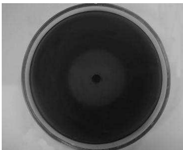
Figure 1. Chitin clearing zone of P. fluorescens – extra cellular effect.

Means followed by the same letter do not differ significantly at P = 0.05 according to DMRT.