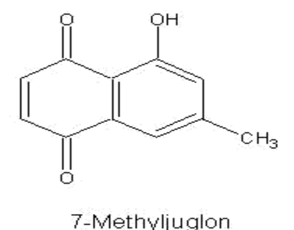
Figure 1. Chemical structure of 7-methyljuglone.