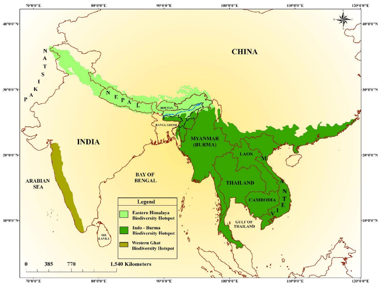
Figure 1. A digitised map showing the Himalayan and Indo-Burma biodiversity hotspot zones and the North Eastern states of India.

activities of oil explorations and direct contact of the crude oil, slugs with water and soil. The unplanned construction of embankments for preventing floods causes the loss of habitat, breeding ground and migration of fish. Several hydroelectric dams have already been constructed, or are under construction. Unplanned