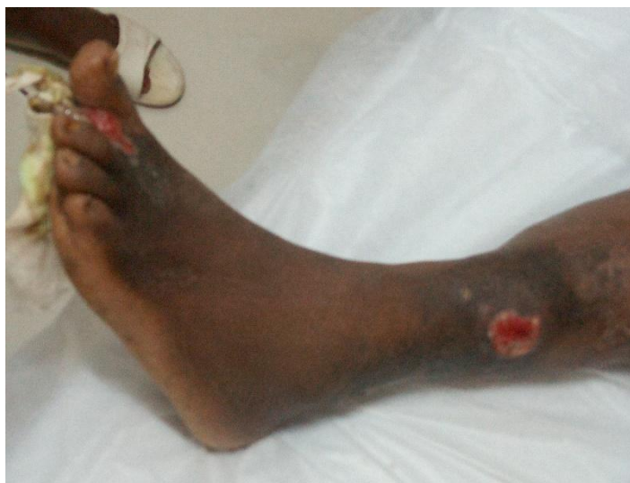
Figure 1. Two ulcers on the left foot and lower leg.