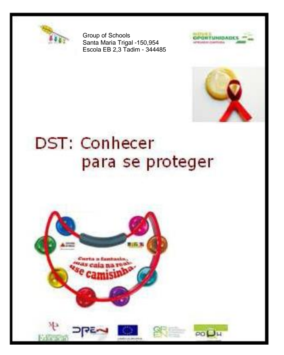
Figure 3. Front page of the written assignment of group G5. (In Spanish)

the number of tasks was needed to understand the concepts, the sites' information was adequate to the answers, the assessment was clear, the navigation through the WebQuest was easy and everyone knew