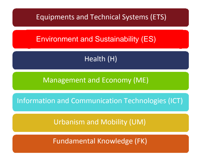
Figure 2. Generating cores of each of the competence units (Gomes et al., 2006: 50).

culture, language and communication (CLC) – are considered to be of an instrumental and operational nature, involving domains of specific competences and covering very different scientific and technical fields, although using equal structures and the same conceptual reference elements (Gomes et al., 2006).