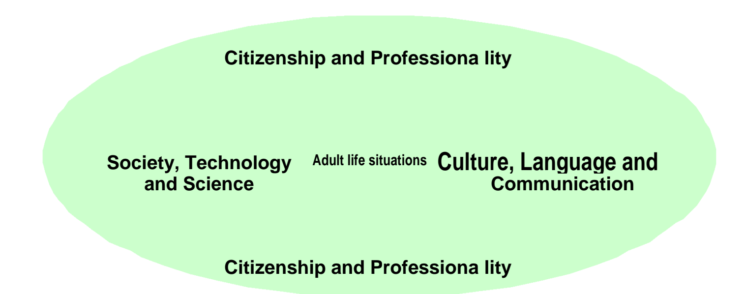
Figure 1. Scheme of the key competences for the secondary education level adult education and training (Gomes et al., 2006: 24).