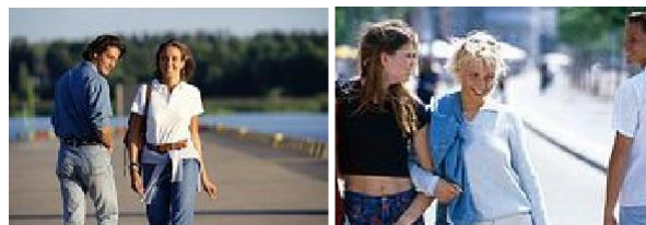
Item 1 Item 2