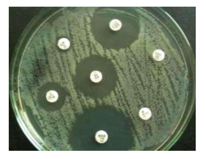
Figure 2. The antimicrobial susceptibility pattern of microorganism screening testing for ESBL.