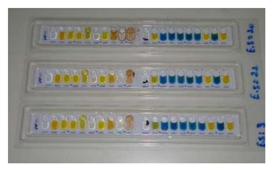
Figure 1. The API 20E used for biochemical confirmation of microorganisms.