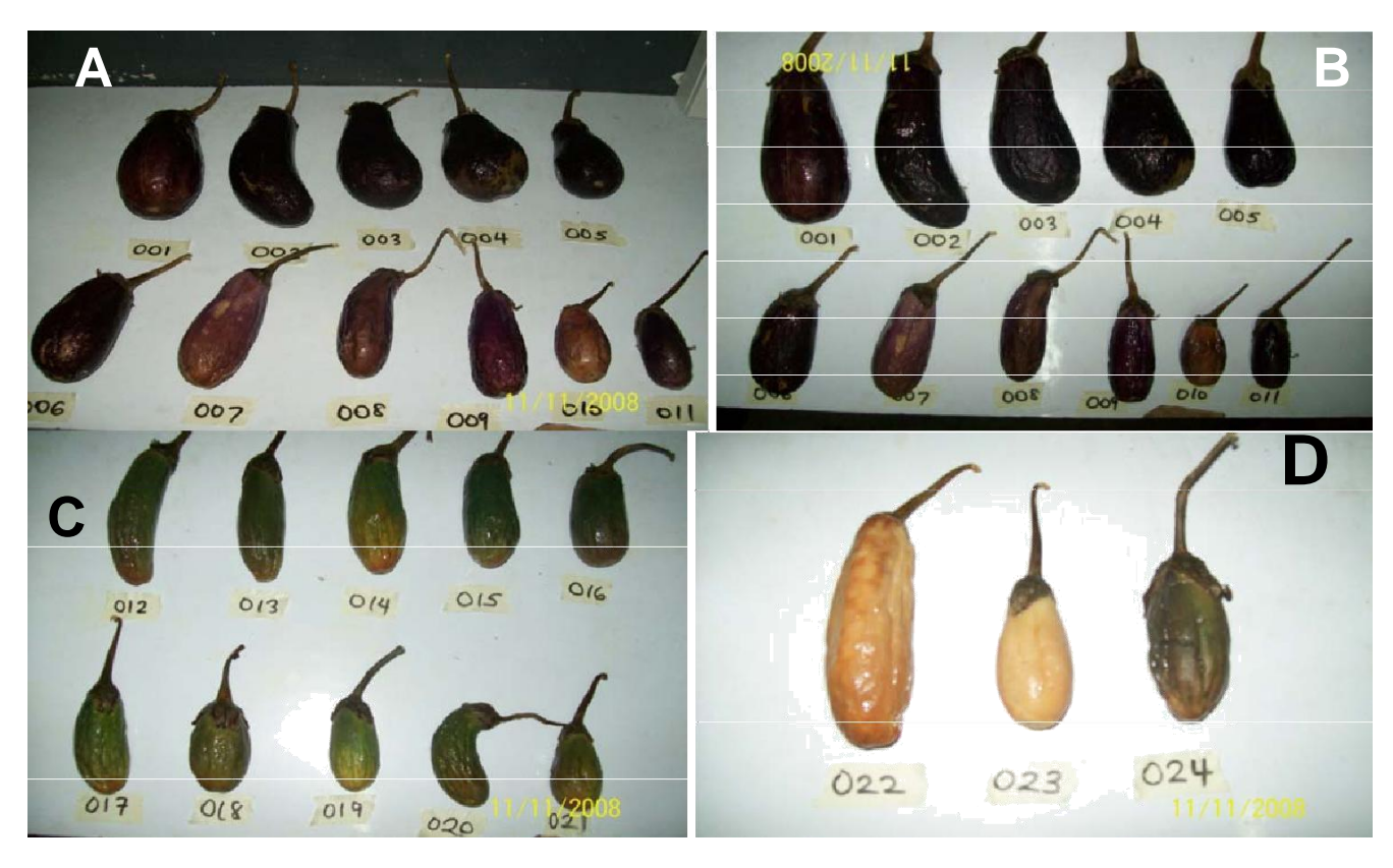
Figure 1. Samples of S. melongena collected for this study and their different shapes and colours. A and B Black purple colour of samples 001 to 011; C, green colour of samples 012 to 021; D, White colour of Samples 022 to 024.

Documentation and Analysis Systems (UVdoc, GA-9000/9010 Version 12, Uvitec, Cambridge, UK).