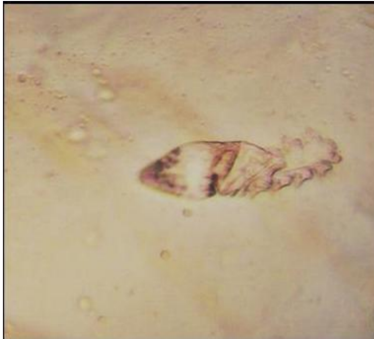
Figure 1. Adult Demodex spp. 100X.