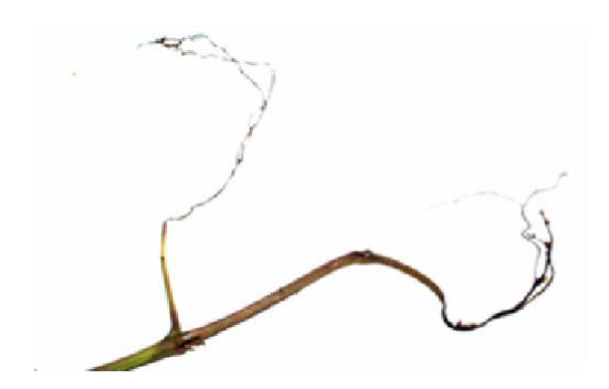
Figure 2 . Tip dieback on rainy season growth of the grapevine, Vitis vinifera cvar Anap-e-Shahe.

disease intensity (Figure 5). Lesions on internodes of canes, spurs and branches sporadically developed into cankers which also girdle to kill off all distal portions above the canker zone resulting in cane, spur and branch dieback. Dieback from cankers was most problematic where cankers escaped pruning and subsequently resulted in holdover cankers which caused extensive death, evident as fire blight.