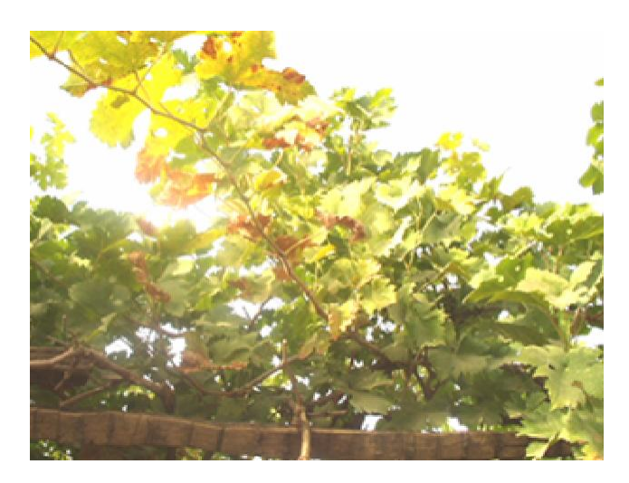
Figure 6. Downy mildew on dry season growth of the grapevine, Vitis vinifera cvar Anap-e-Shahe in January.