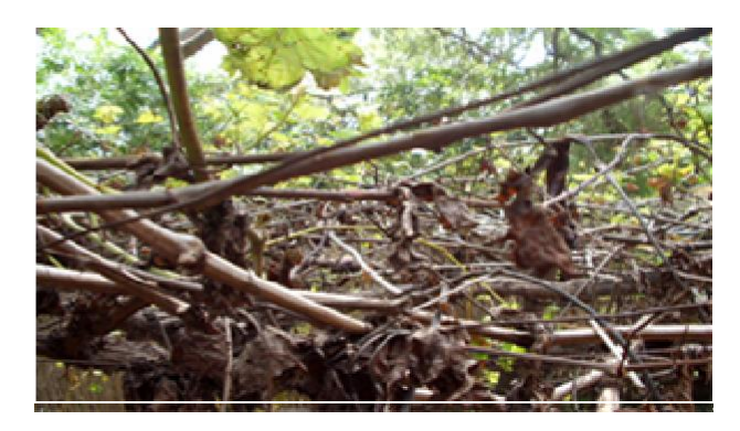
Figure 3. Blight of the crown of rainy season growth (July) of the grapevine, Vitis vinifera cvar Anap-e-Shahe.

disease intensity (Figure 5). Lesions on internodes of canes, spurs and branches sporadically developed into cankers which also girdle to kill off all distal portions above the canker zone resulting in cane, spur and branch dieback. Dieback from cankers was most problematic where cankers escaped pruning and subsequently resulted in holdover cankers which caused extensive death, evident as fire blight.