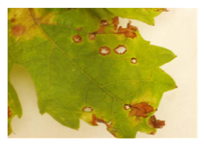
Figure 5. Leaf section of the grapevine, Vitis vinifera cvar Anap-e-Shahe, from dry season growth necrosis at the cessation of downy mildew epiphytotic consequent on increased temperatures in February.