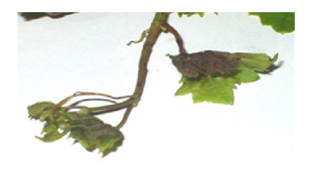
Figure 1. Leaf and cane lesions on rainy season growth of the grapevine, Vitis vinifera cvar Anap-e-Shahe.

the frequencies of the two (2) samplings of each month.