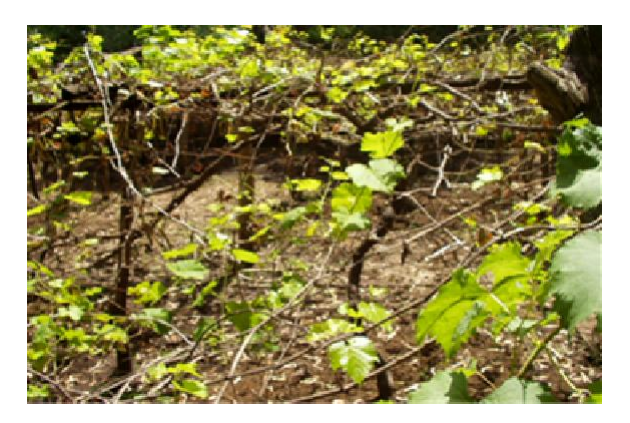
Figure 4. Close of rainy season growth (compensatory response to defoliation in August) of the grapevine, Vitis vinifera cvar Anap-e-Shahe.