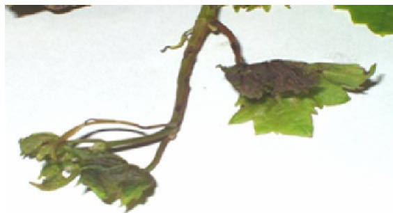
Figure 1. Leaf and cane lesions on rainy season growth of the grapevine, Vitis vinifera cvar Anap-e-Shahe.

the frequencies of the two (2) samplings of each month.