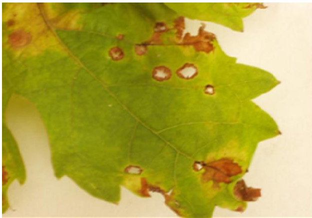
Figure 5. Leaf section of the grapevine, Vitis vinifera cvar Anap-e-Shahe, from dry season growth necrosis at the cessation of downy mildew epiphytotic consequent on increased temperatures in February.