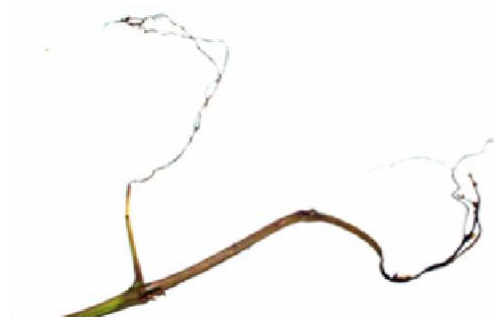
Figure 2. Tip dieback on rainy season growth of the grapevine, Vitis vinifera cvar Anap-e-Shahe.