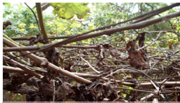
Figure 3. Blight of the crown of rainy season growth (July) of the grapevine, Vitis vinifera cvar Anap-e-Shahe.

disease intensity (Figure 5). Lesions on internodes of canes, spurs and branches sporadically developed into cankers which also girdle to kill off all distal portions above the canker zone resulting in cane, spur and branch dieback. Dieback from cankers was most problematic where cankers escaped pruning and subsequently resulted in holdover cankers which caused extensive death, evident as fire blight.