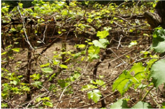
Figure 4. Close of rainy season growth (compensatory response to defoliation in August) of the grapevine, Vitis vinifera cvar Anap-e-Shahe.