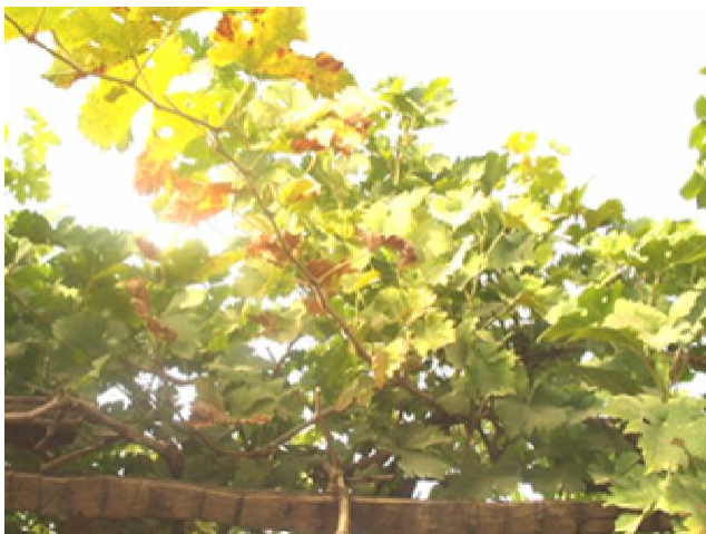
Figure 6. Downy mildew on dry season growth of the grapevine, Vitis vinifera cvar Anap-e-Shahe in January.