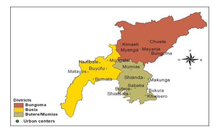
Figure 2. Main urban centers where input stockists are located.

yielding and matures early. In addition, it has an advantage over other hybrids in that it is the only hybrid in the market that is tolerant to maize streak virus and to striga weed.