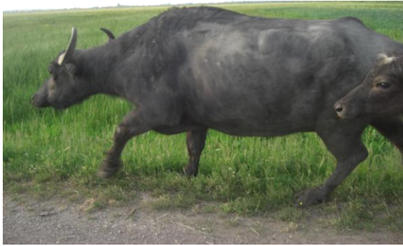
Figure 1. Type of buffaloes in Kosovo.