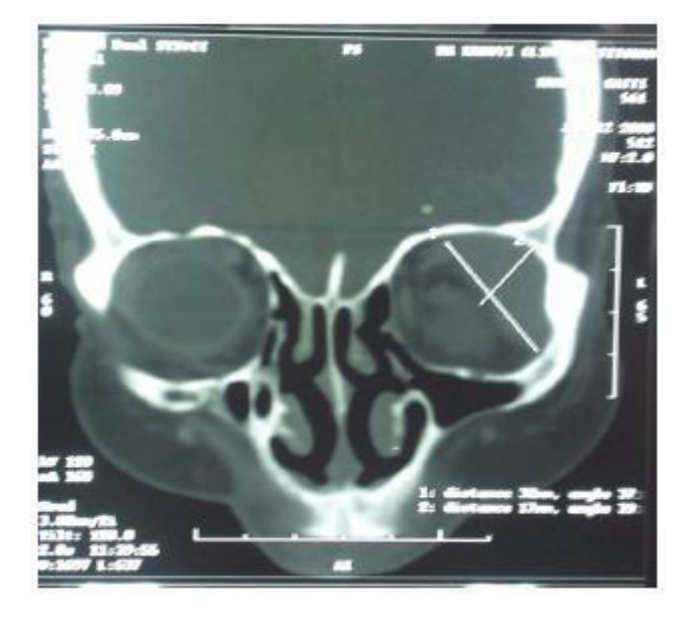
Figure 2. Orbital process with extension to the lacrimal glands and the upper eyelid.

musculature. Primary non-Hodgkin's lymphoma (NHL) of the orbit is a rare presentation, representing 8-10% of extranodal NHL (Freeman et al., 1972) and only 1% of all NHL (Fitzpatrick and Macko, 1984). Generally, it has an indolent course. Orbital lymphoma in contrast to ocular lymphoma is rarely associated with primary central nervous lymphoma. Majority of the orbital lymphomas are of low-grade variety (84%) and only 16% are of highgrade histology (Bessel et al., 1988). Orbital lymphomas are predominantly of mucosa associated lymphoid tissue (MALT) histology (57%), but they also include other histological subtypes, such as follicular lymphomas (19%), diffuse large B-cell lymphomas (DLCL) and mantle cell lymphomas (Coupland et al., 2002; Fung et