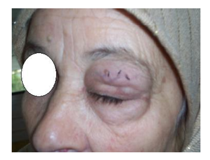
Figure 1. Left orbital mass.