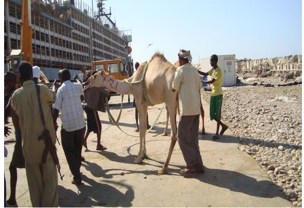
Fig. 4 Camels being loaded on a ship- Bosasso port