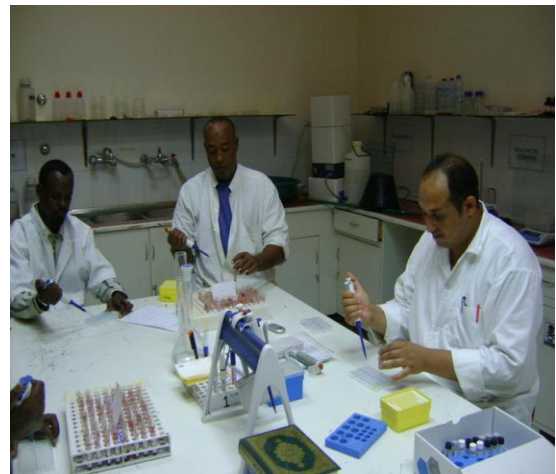
Fig. 5 Serum screening in the laboratory-Bosasso