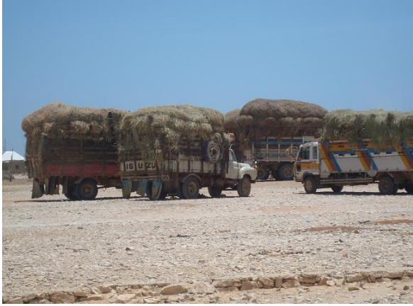
Fig. 1 Pasture on Lorries for sale Bosasso