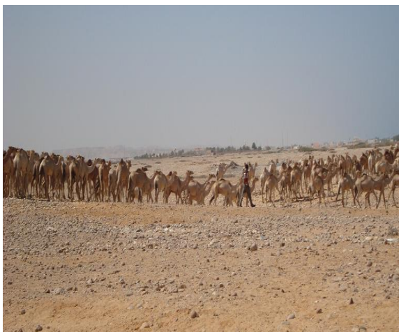
Fig. 3 Camels trekking to export port-Bosasso