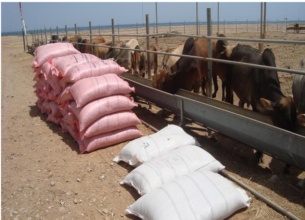
Fig. 2 Livestock concentrates-Berbera