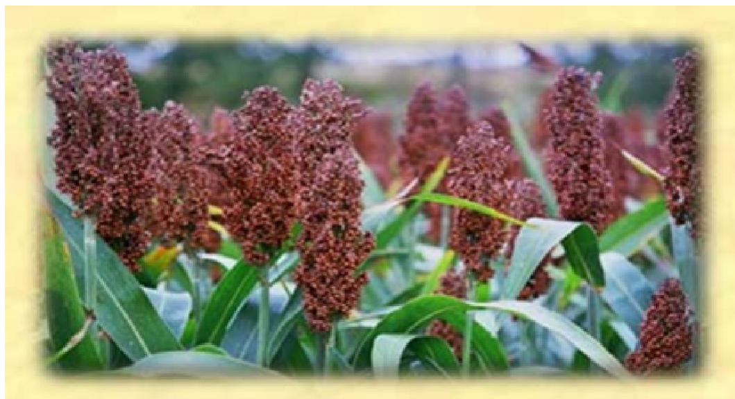
Figure 1. Sorghum bicolor (L.) Moench.

ted sorghum grains are generally used for the preparation of “tô”, porridge, and couscous. Malted sorghum is used in the process of local beer “dolo” (reddish, cloudy or opaque), infant porridge and non-fermented beverages. Starch is the main reserve polysaccharide of the plant kingdom, and the principal source of carbohydrate from agricultural origin, being the end product of photosynthesis. Sorghum grains like all cereals grains are comprised primarily of starch. \alpha -Amylases are endoenzymes that randomly split -(1\rightarrow4) -linkages in starch. \beta -Amylases on the other hand, are exoglucosidases releasing maltose units from starch. The purpose of this review was to overview the current knowledge on the relevance of starch content and the activities of amylases in sorghum food processing in West Africa.