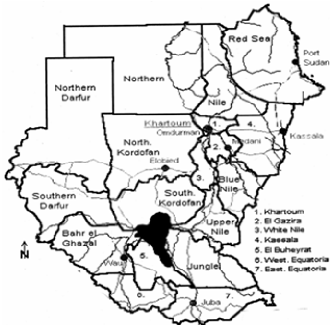
Figure 1A. Unity State ( ), southern Sudan occupies a central location in southern Sudan covering an area of about 170.520 square kilometers. It is located in the western upper Nile area of southern Sudan between latitude 7°- 10.3° and longitude 29° - 31°.