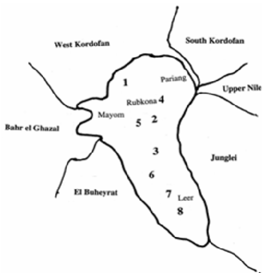
Figure 1B. The eight localities sampled for RP detection in Unity State, southern Sudan: 1 = Abyemnem; 2 = Bentiu; 3 = Nialdiue; 4 = Rubkona; 5 = Thar; 6 = Thoan; 7 = Guity; 8 = Kilo 50.

ted against the disease in Sudan and consequently no outbreaks were recorded for the disease, at least, in the northern regions of the country. However, some loci in