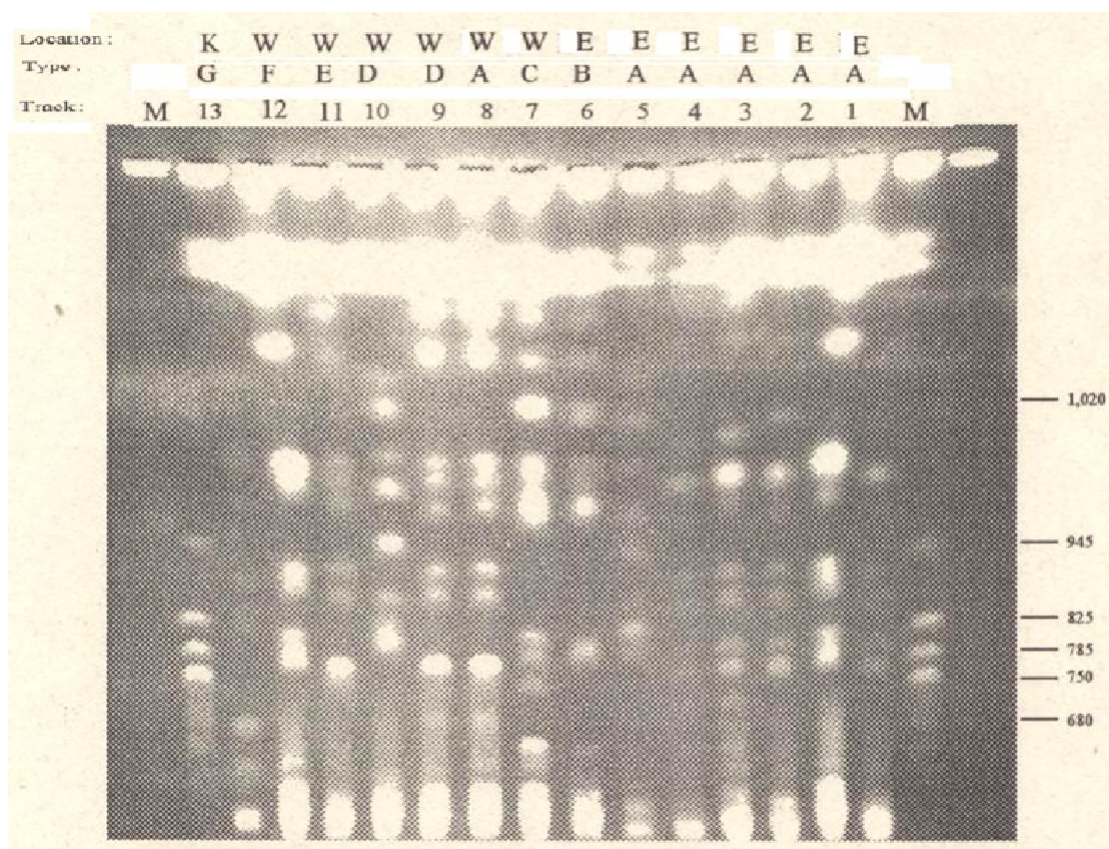
Figure 1. Large sized chromosomes of sudanese T. evansi .

c 100 = Minimum Curative Dosage in 100% infected mice.