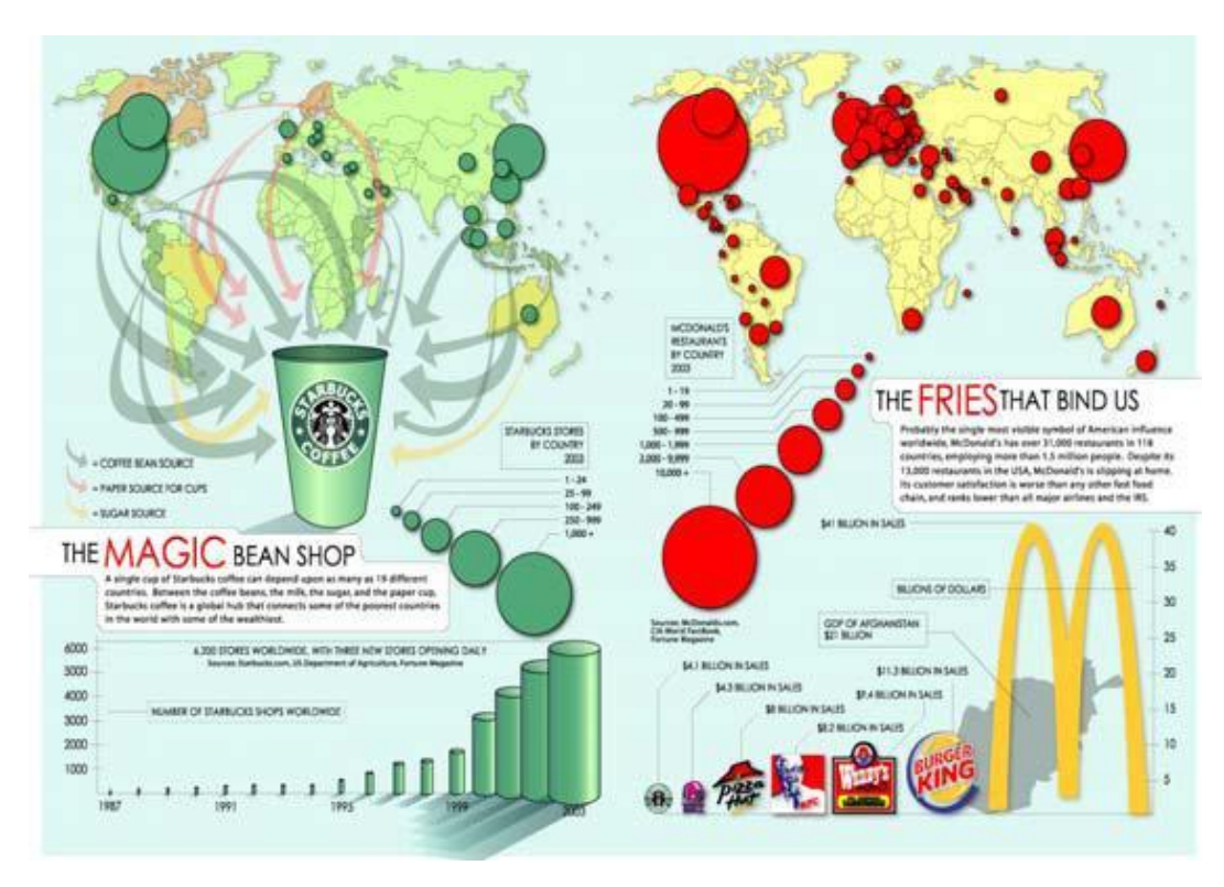
Figure 2. McDonalds and Starbucks operations across the globe.

adjustment loans (SALs) to the developing nations of the world. These SALs were the means through which the US could: "blast open Third World economies once "the Reagan Administration came to power with an agenda to discipline the Third World" (Bello, 1999).