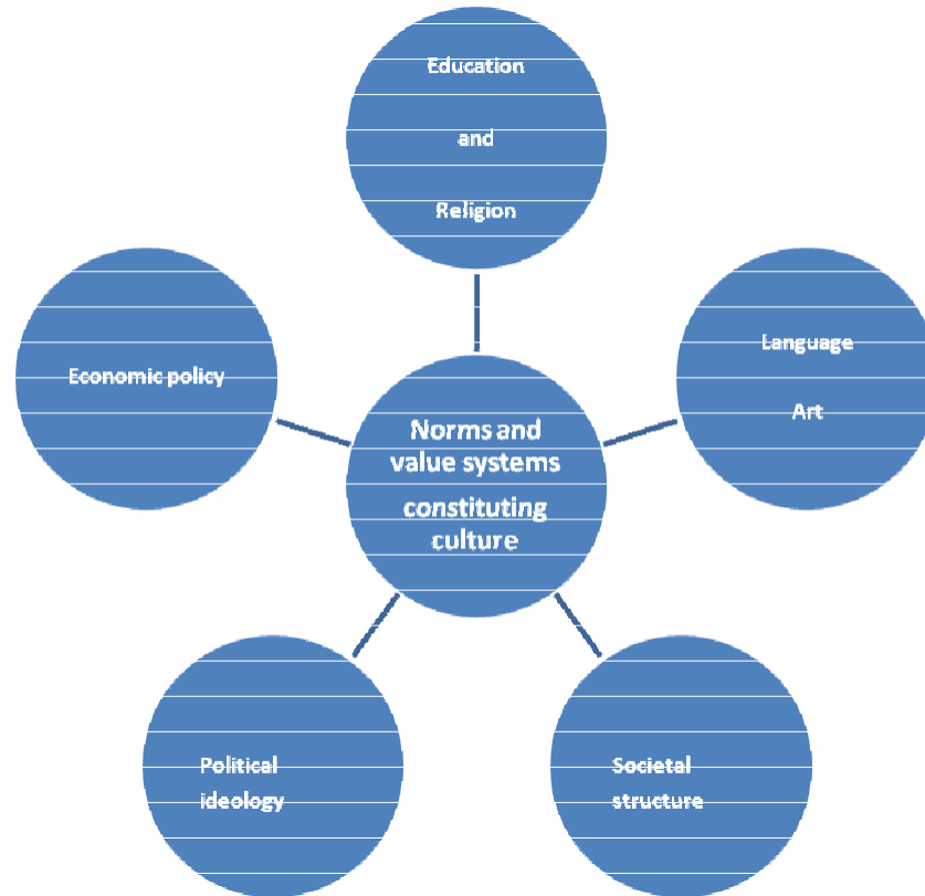
Figure 1. Adapted from Hill, C.W.L. 2007, International Business, Competing in the global marketplace, 6 th Edition.

Due to all the global travels there was an incessant constant mixing of philosophies, ideas, languages, traditions and customs between the locals and the foreign conquerors or traders and inhabitants. Colonialism made huge impacts on agriculture, trade, the environment and culture on a global scale. The Great War (1914-1917) had a devastating effect on the global economic environment and this led to the Great Depression in 1929 and the Gold Standard crisis in the early 1930s.