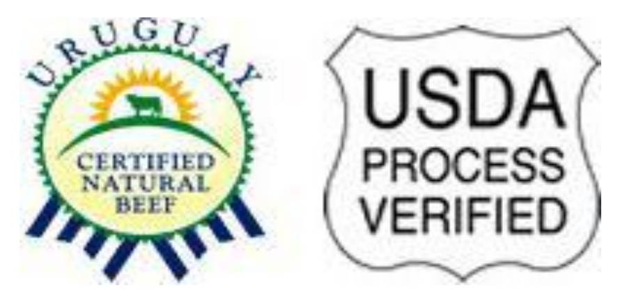
Figure 3. PCNCU and USDA Process Verified Program logos. Source: INAC (2007).

States with the USDA process verified seal and to make a detailed description of the product's characteristics, as for example: free of hormones and antibiotics, free of animal protein, traceability, etc. "This has been a really important stage in the differentiation of our meat in comparison to other countries that sell meat to the United States". Although the volume exported to the USA with this certification is still low – around 600 tons per year - the recognition is considered an important marketing tool for Uruguayan meat.