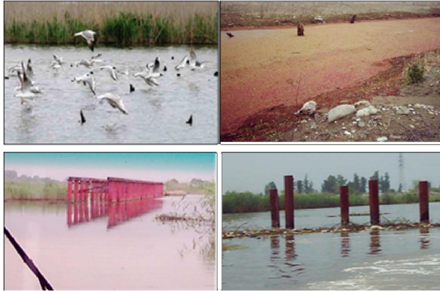
Figure 2. Anzali Wetland and Azolla Pinnata growth on the wetland water surface.

ing more than 500 in mid-winter. Pelecanus onocrotalus (White Pelican), P. crispus (Dalmatian Pelican), Botaurus stellaris (Bittern) and Anser erythropus (Lesser White-fronted Goose) are occasional winter visitors and Oxyura leucocephala (White Head Duck), Charadrius asiaticus (Caspian Plover), Vanellus gregarius (Lapwing) and Gallinago media (Common Snipe) have been recorded on passage. Other noteworthy birds include Cygnus columbianus (Bewick Swan), Athya nyrica (Ferruginous Duck), Branta Ruficollis (Red Breasted Goose) and Athya marila (Scaup), all of which are endangered in Iran.