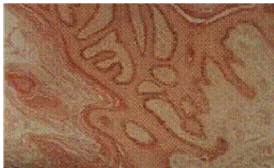
Figure 2. P. osun in 70% ethanol (skin), X100.