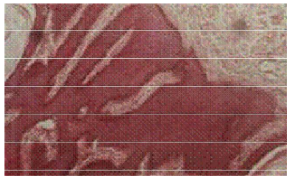
Figure 1 (Control). Haematoxylin and eosin technique (skin), X100.

1% (w/v) alcoholic P. osun in solutions of 1% acetic acid (Figure 3) and of ammonium hydroxide (Figure 5) (acidic and alkaline solutions respectively) stained tissue sections reddish brown. The addition of potassium alum as a mordant did not improve the staining qualities of P. osun as shown in Figure 4.