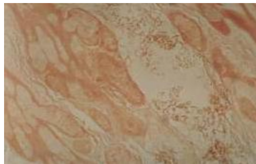
Figure 3. P. osun in 1% acetic acid in 70% ethanol (skin), X100.