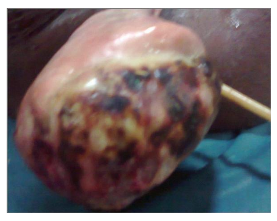
Figure 1. Inversion of uterus with fungating polypoidal growth protruding out of introitus.