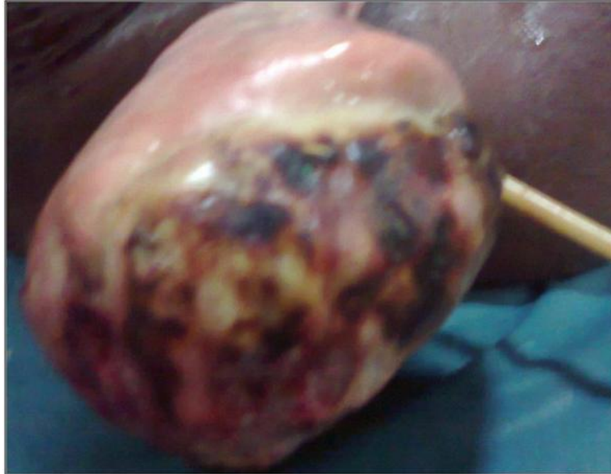
Figure 1. Inversion of uterus with fungating polypoidal growth protruding out of introitus.