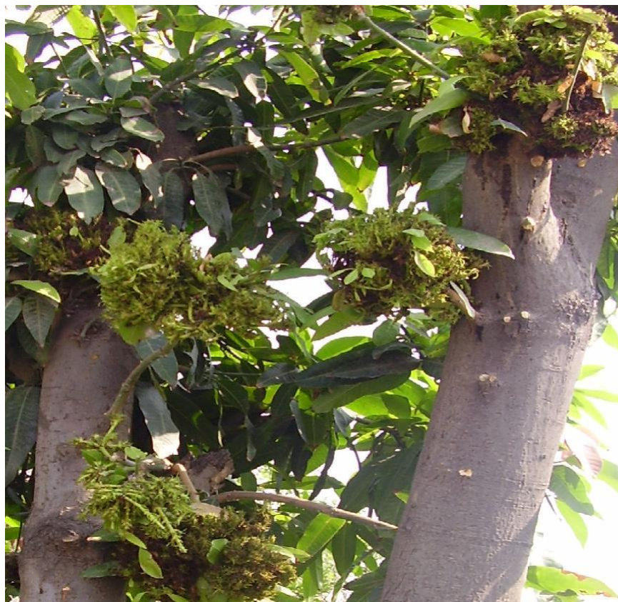
Figure 1. Malformed heads hanging on mango tree.