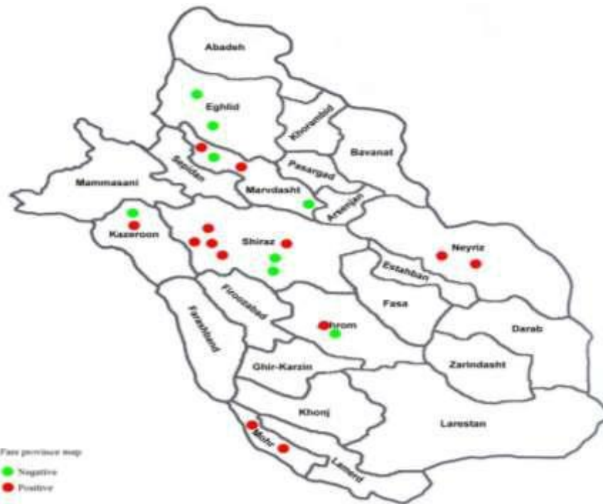
Figure 3. Map of Fars province showing the selected areas for sample collection. Dark circles show areas that the chickens had log 2 HI antibody titer ≥4 and light circles show areas that the chickens had log 2 HI antibody titer ≤4.