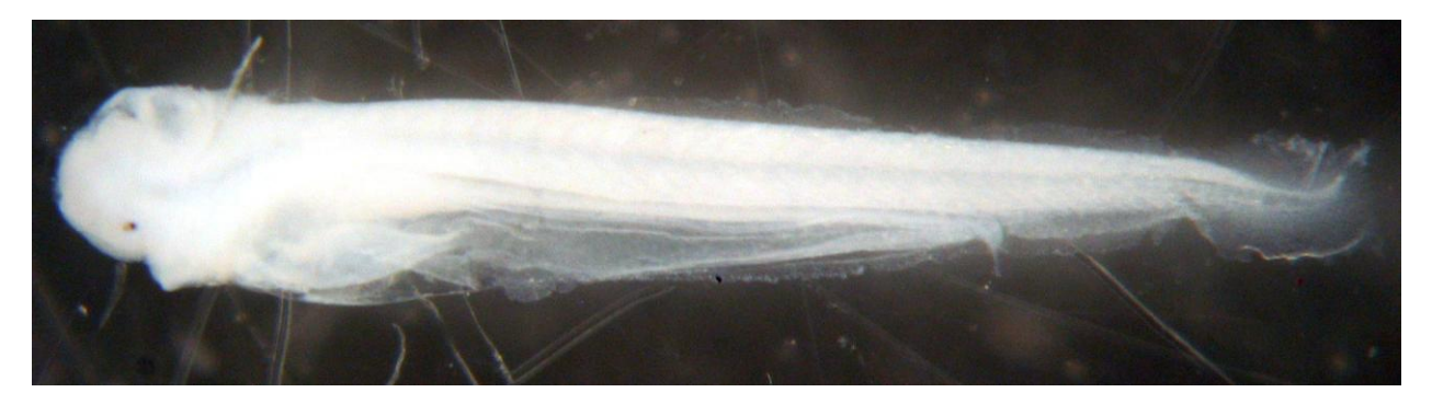
Figure 2. Newly hatched larvae of L. parvus after 20 h post-hatching.