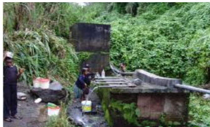
Figure 1. Community water supply scheme (Koke).