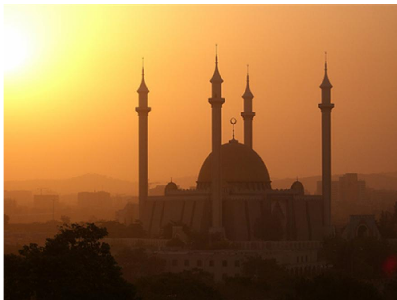
Figure 1. The mosque in Abuja Nigeria, seen through the harmattan haze. 1

It is the season to cover up. Beginning in November of every year and ending around March, fine particulate matter (typically 0.5 – 10 micrometers) emanating from the Sahara desert blow south, obscuring vision and laboring breathing for everyone (Figure 1). In addition, the dry dusty winds cause a variety of domestic inconveniences because of the lay-ers of dust that envelope everything both outdoors and indoors. This is harmattan season, and it is ingrained in all West