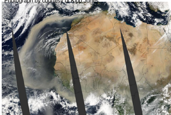
Figure 2. Harmattan dust storms from the Sahara desert as captured by NASA's MODIS satellite reaches across to the Atlantic Ocean in the South, and all the way to South America and the Caribbean islands 2 .