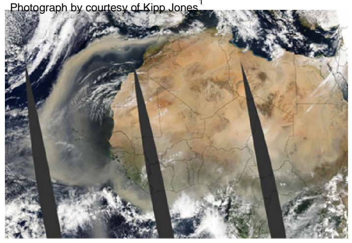
Figure 2. Harmattan dust storms from the Sahara desert as captured by NASA's MODIS satellite reaches across to the Atlantic Ocean in the South, and all the way to South America and the Caribbean islands<sup>2</sup>.

Figure 1. The mosque in Abuja Nigeria, seen through the harmattan haze.