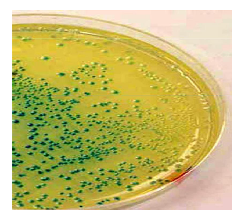
Figure 1. Green colonies of Lactobacillus strains on X-gal plates.

tolerans L. plantarum (ranging from 606 to 1,326 U/ml) isolated from milk. Low value of -galactosidase enzyme was detected in two strains of L. casei subsp. rhamnosus and in one strain of L. plantarum was 22.7, 44.4 and 64.4 (U/ml) in milk lactobacilli, respectively.