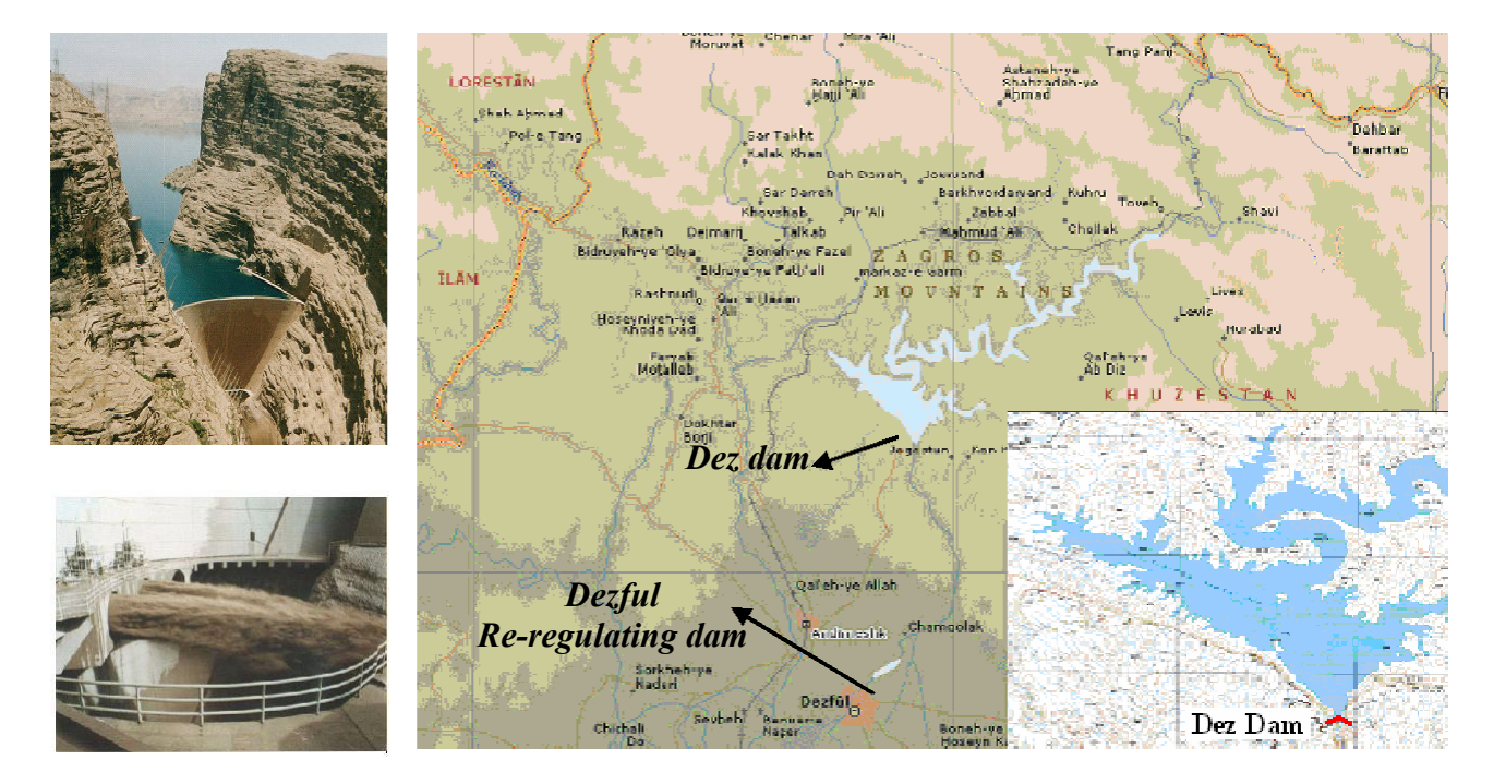
Figure 1. Map of Dez dam project and flushing br irrigation outlets.

It has been utilized since 1972 and the previous surveys show that 40% of the Dezful re-regulating dam reservoir capacity is already has been filled with sediment (Sadeghi, 2002).