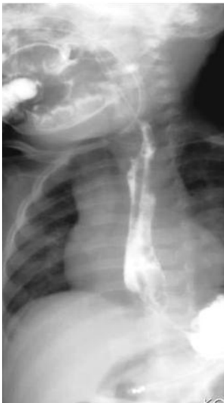
Figure 5. Post-surgery repair oesophagram shows no tracheo-oesophageal fistula. (Source: patient's data).

projection due to the struggling state of the child. Here the rest of the contrast (about 12 ml) was poured into a feeding bottle (a bottle with nipple like tip) and given to the child to drink continuously while in the AP position. Because the child had not eaten two hours to the