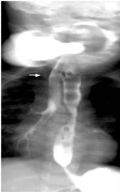
Figure 4. AP view depicting a typical H - Tracheo-oesophageal fistula. (Source: patient's data).