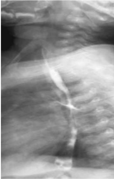
Figure 2. Oblique view showing contrast leakage but no obvious H-type fistulous connection.