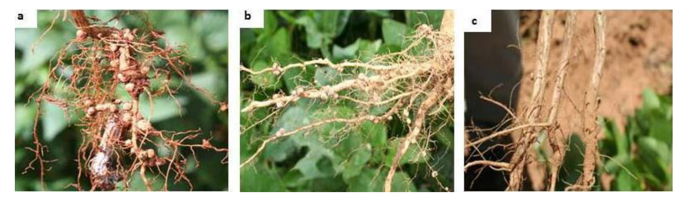
Figure 1. On farm evaluation of randomly uprooted nodules (average of three) for three soybean farms six to eight weeks after planting and inoculation. The scoring scheme of Corbin et al. (1977) was used to evaluate the effectiveness of the nodules based on color (0-3), size (0-3), number (0-4) and position (0-4) of nodules. a) Piet Retief 1 nodules with a scoring of 3, 3, 3, 4; b) Reitz nodules with a score of 1, 2, 2, 2; c) Bothaville 1 with score of 0, 0, 0, 0 (without nodules).

Table 2. Soil chemical and physical properties from nine soybean farms in three provinces in South Africa.