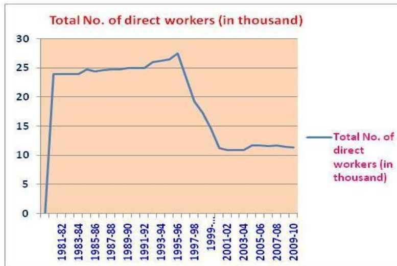
Diagram-1 Sex and Caste- wise Classification