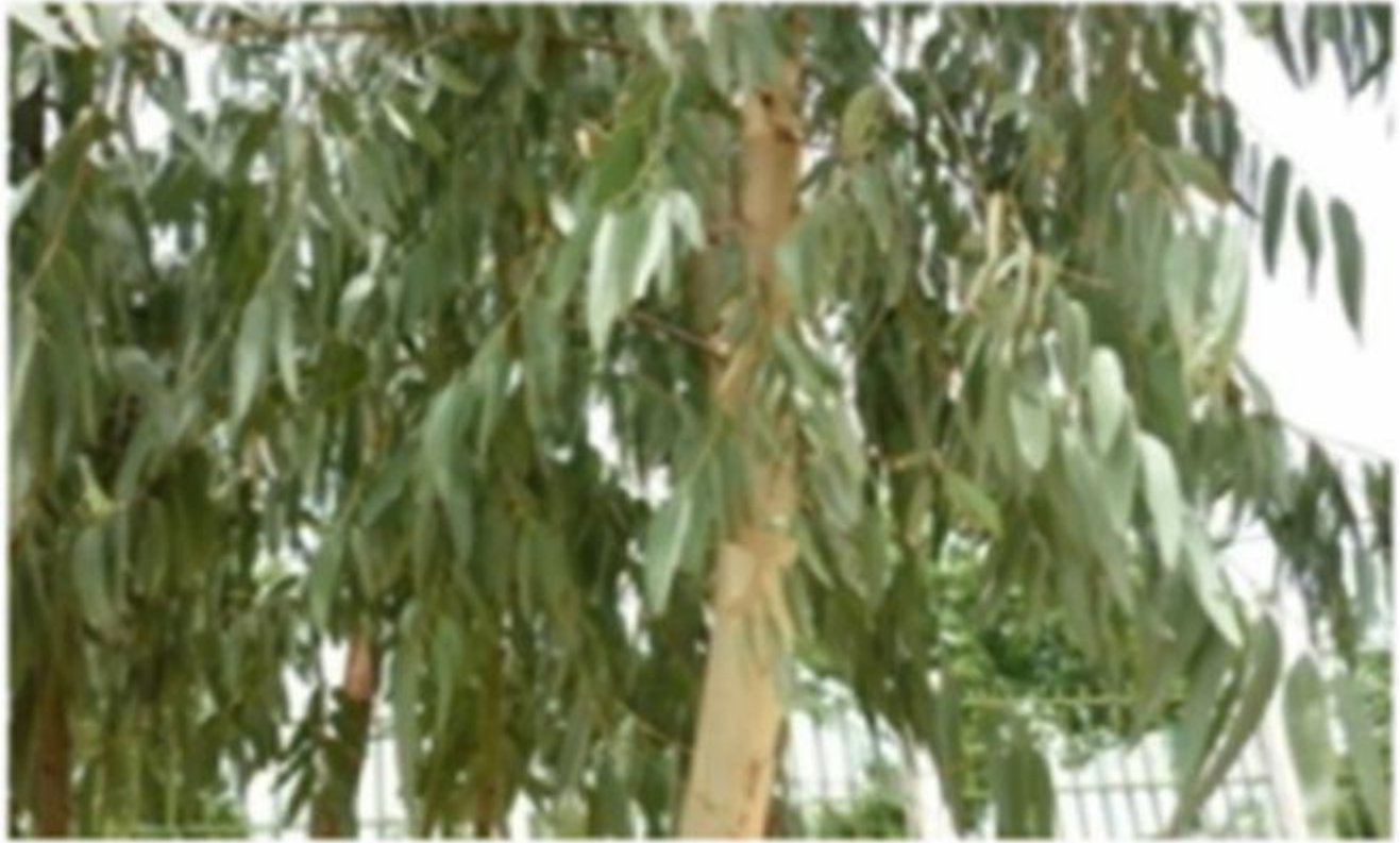
Figure 10. Eucalyptus sp. Location: Maroua (Ward Domayo) Date: 20/12/2009.

or the unripe fruit eaten. The lack of control of dosage is sometimes the cause of an overdose due to high concentrations of toxic compounds in certain species (Rates, 2001). Using this case as control is also indicated by Titanji et al. (2008) in other areas of Cameroon and by Asase et al. (2005) in Ghana. M. Indica is used against headaches and diarrhea (Betti, 2004). The leaves or bark are anti-inflammatory drugs (Burkill, 1985; Oliver -Bever, 1986; Kambu et al., 1989; Das et al., 1989). The tender leaves are used as diuretics (Anon. 5, 1986), for the treatment of hypertension and of infertility (Igoli et al., 2005). According to Das et al. (1989), this species is used to treat dental problems.