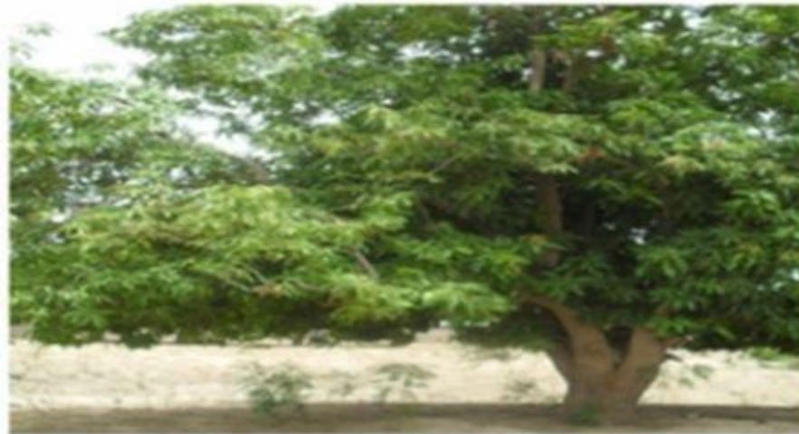
Figure 8. Mangifera indica . Location: Maroua (Ward Ouro-Tchede) Date: 11/12/2009.

negro (Figure 7) can reach one meter in height or more. Small fine hairs covering almost all parts of the plant. Its leaves are usually composed of 8 pairs of oval leaflets terminating in a point. Its yellow flowers produce small pods and archea in medium containing each 12 small seeds (Anon. 5, 1986).