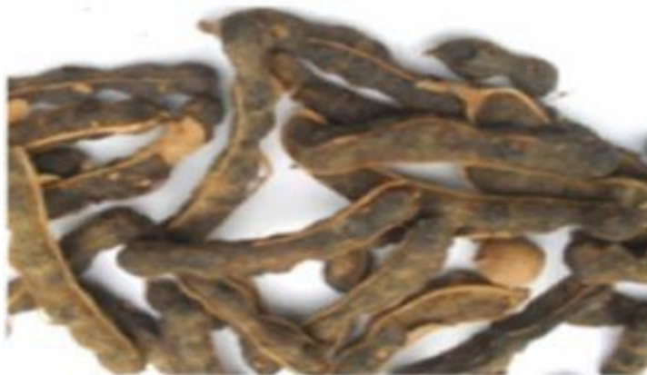
Figure 4b. Fruits of Tamarindus indica .