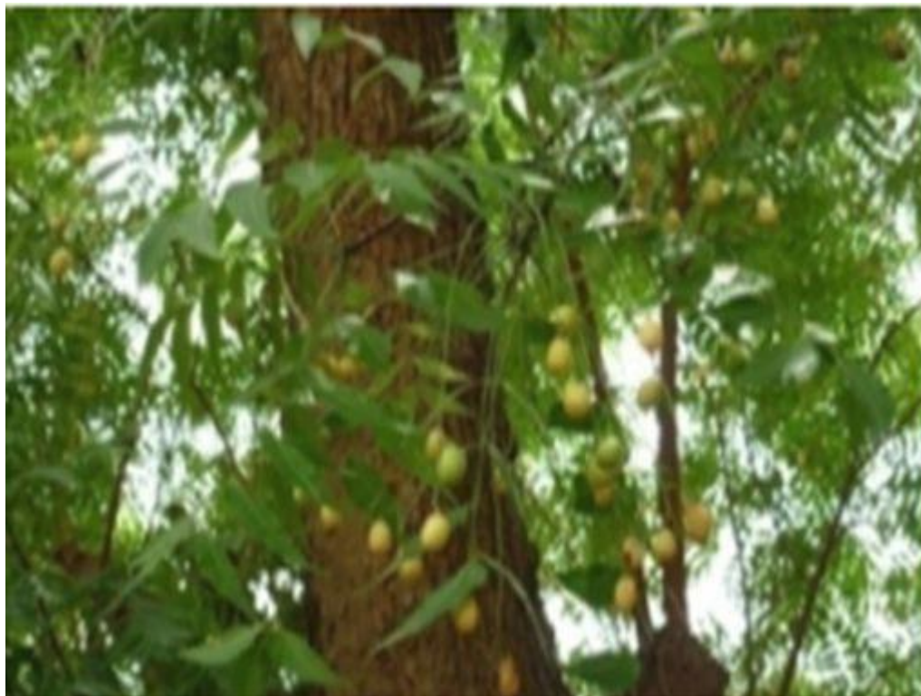
Figure 3. Azadirachta indica L. Location: Maroua (Ward Domayo) Date: 7/12/2009.

bath, or even boiling the leaves of indicators with those of the leaves of A. indica and the filtrate diluted to serve Jatropha gossipifolia and Combretum sp. The local population has no standard dose for administering the extracts from medicinal plants in treating malaria.