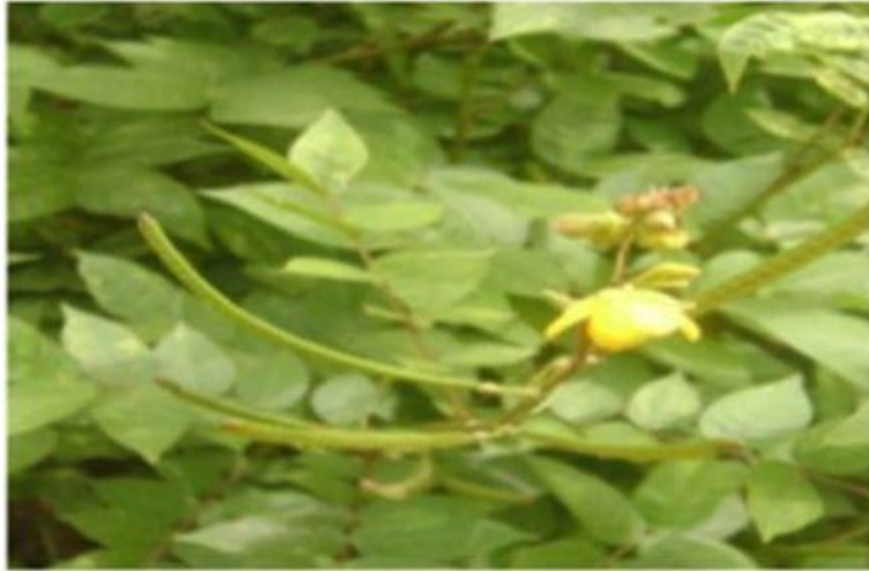
Figure 7. Cassia occidentalis . Location: Maroua (Ward Ouro-Tchede) Date: 11/12/2009.