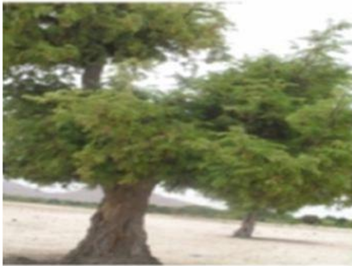
Figure 4a. Tamarindus indica L. Location: Maroua (Ward Ouro-Tchede) Date: 7/12/2009.