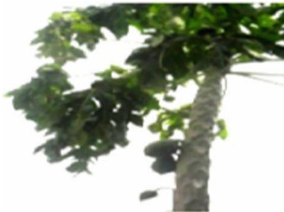
Figure 6. Carica papaya L. Location: Maroua (Ward Ouro-Tchede) Date: 17/12/2009.

family. Its size varies from 2 to 15 m. It is a perennial plant with leathery leaves that adapts to all types of tropical and warm temperate climates. It grows on sandy and clay soils (Anon. 5, 1986).