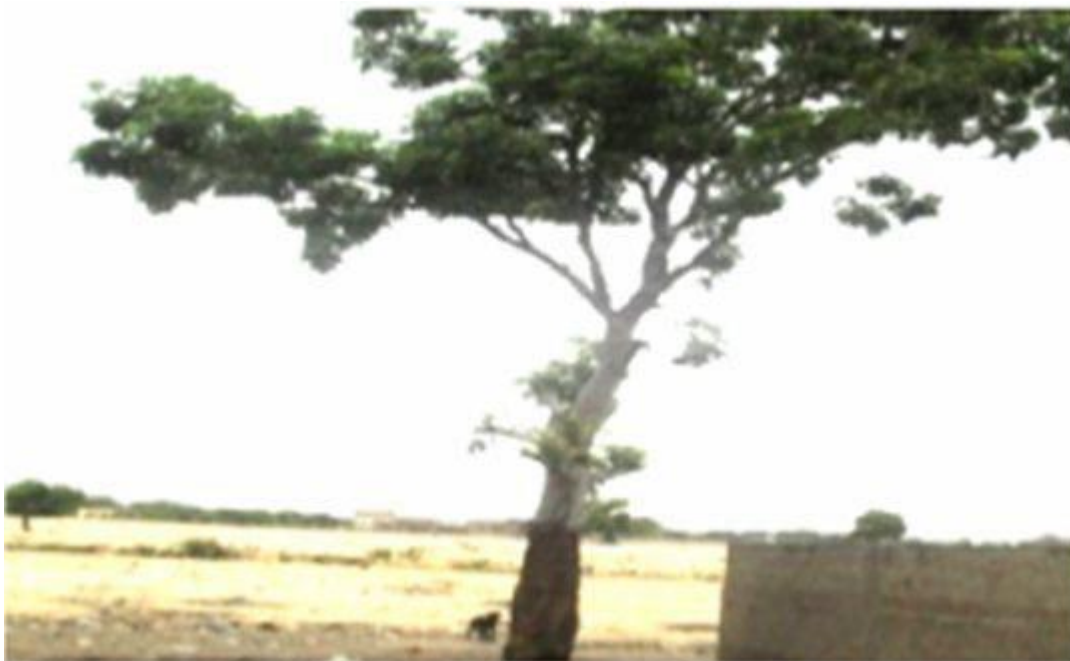
Figure 11. Khaya senegalensis . Location: Maroua (Ward Ouro-Tchede) Date: 27/12/2009.

K. senegalensis (Figure 11) may exceed 2 feet in diameter. Its bark is grayish, dark, scaly leaves are glabrous, paripinnate mainly grouped around the ends of branches with 3 to 7 pairs of leaflets opposite or subopposite. The distribution is from Senegal, Uganda and present eastern Sudan (Kerharo and Adam, 1974).