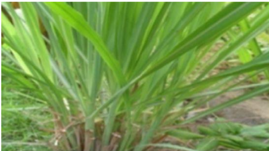
Figure 12. Cymbopogon citratus (D. C) Strapf. Location: Maroua (Ward Ouro-Tchede) Date: 27/12/2009.

families as antimalarial drugs. The top ten most widely used plants by the Maroua people were recorded and described. The Giziga, the Fulbe and Toupouris use these plants much more to treat malaria. Leaves (34%), bark (24%) and roots (18%) are the parts most commonly used to treat malaria. It is important that the scientific community, Governments and donors get involved in the operation of these antimalarial plants which are effective against malaria that plagues our society. Research on active principles present in these plants of the region should be studied in order to spread the results of this work at the national as well as the international level.