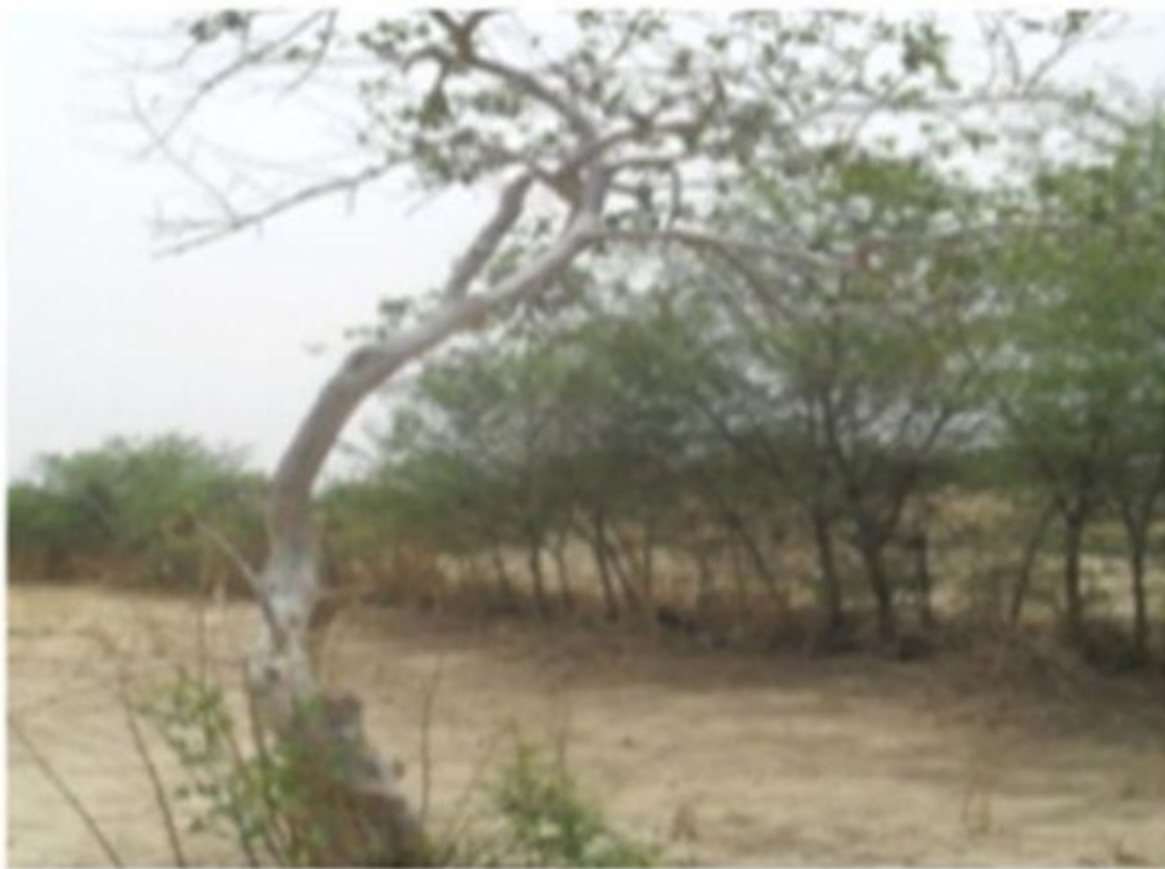
Figure 9. Psidium guajava . Location: Maroua (Ward Ouro-Tchede) Date: 20/12/2009.

green turning yellow when ripe, round or oval and have a pink flesh containing many seeds (Anon. 5, 1986).