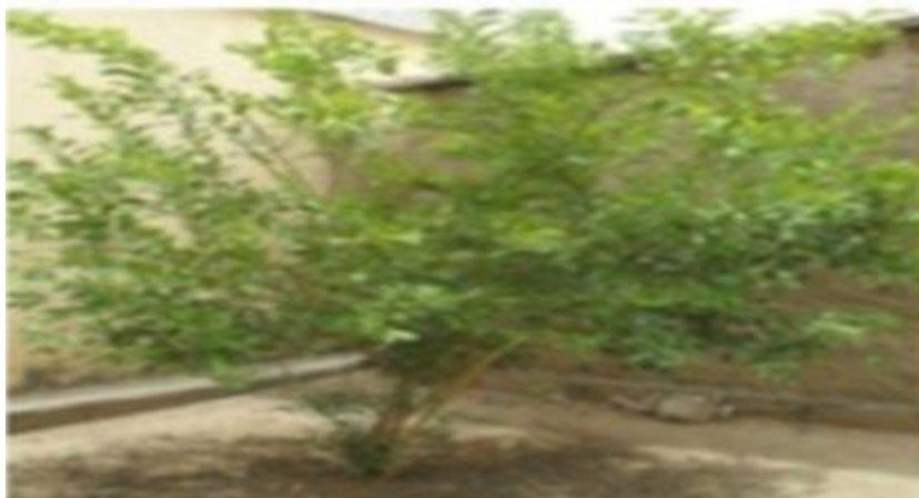
Figure 5. Citrus limonum . Location: Maroua (Ward Ouro-Tchede) Date: 06/12/2009.