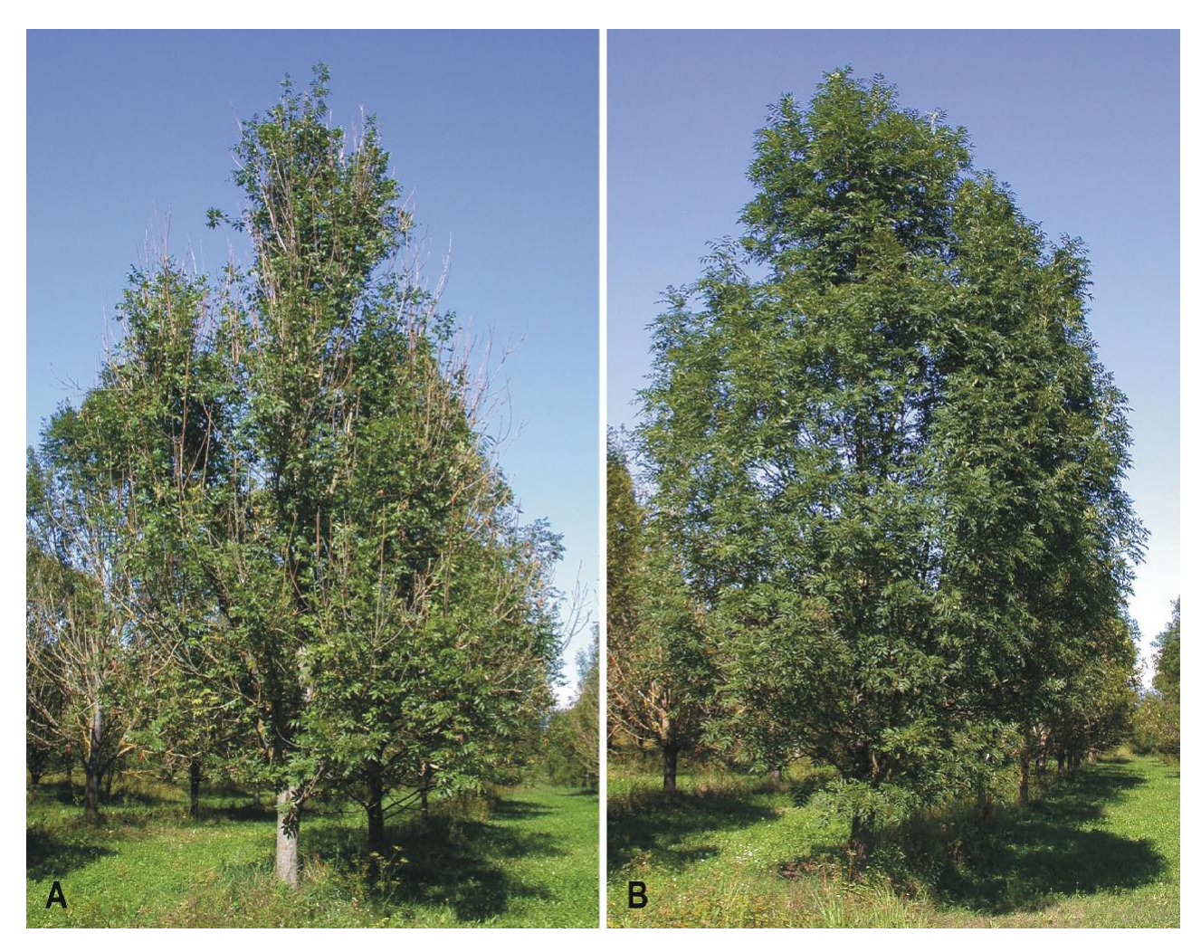
Figure 3. Differences in the intensity of ash dieback between F. excelsior clones in the seed plantation in Feldkirchen an der Donau (17 August 2011): A. Ramet of the most severely damaged clone (number 8), B. Ramet of one of the least damaged clones (number 14) with virtually no dieback symptoms. In both 2009 and 2010 ramets of this clone were also hardly affected by early leaf shedding and remained densely foliated until early autumn.

inspired by the 6-class dwarf mistletoe rating system (Hawksworth et al., 1996), and designation of the particular seven classes used for the ratings (Figure 2) contribute in our opinion to meet the three criteria mentioned previously (accuracy, easy application and comparability). All ratings in the seed plantation were done by the same person (C. Freinschlag), which should have a positive influence on data quality and guarantee comparability of assessments at various dates.