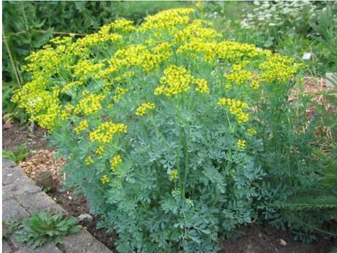
Figure 1. Ruta graveolens (Rue).