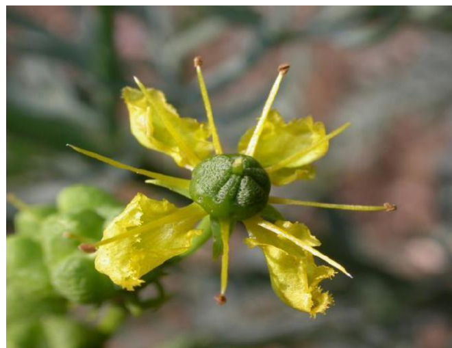
Figure 3. R. graveolens flower.

women because in high concentrations it can provoke hyperemia in the uterus and high mobility (oxytocic action) which may cause abortion. At the concentrations needed for this effect, it can cause the death of a pregnant woman. R. graveolens is rich in rutin which act as a venotonic and capillary protector. Rutin helps increase visual sharpness and benefits other visual problems, and it was used against edema, thrombogenesis, inflammation, spasms, and hypertension (Miguel, 2003). The essential oil is spasmolytic, anti-inflammatory and antihistaminic and is a vermifuge (Mansour et al. 1989). R. graveolens can also be used as a rubefacient, applied in poultices for rheumatic pain, dislocations, tendon strains, varicose veins and skin conditions such as psoriasis and eczema. It has bitter eupeptic properties, so it is prescribed for stomach and intestinal disorders. If externally spread on moist skin under direct sunlight it leads to photosensitivity, caused by furanocoumarins resulting in hyper pigmentation, swelling, itching, and even burns and blistering (Miguel, 2003).