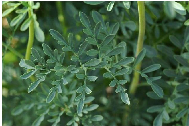
Figure 2. R. graveolens leaves.