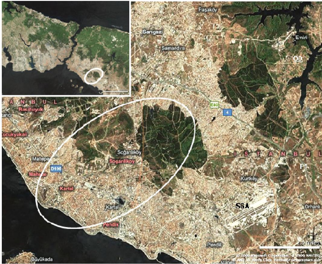
Figure 1. The satellite view of Istanbul (upper left corner) and the Kartal District (above). The white bars indicated 10 miles (upper left) and 2.5 miles (right down corner). The studied area was circled. (SGA: Sabiha Gökçen Airport, F1: Formula-1 Area, OD: Ömerli Dam). The picture was prepared by using Google Earth Programme.

The results altered population dynamics, species composition, and altered energy and matter fluxes in urban ecosystem (Sukopp, 2004). However, there are some basic information about urban ecosystems, which are required for the ecological analysis. The most important of them include abiotic components like geology, topography, soil and climate and biotic components as vegetation, flora and fauna, the human land uses and their changes (farming, livestock, forestry, settlements, and infrastructure). Finally, there are also some cultural factors e.g. archaeological, historical, traditional features, aesthetics etc., which are occasionally integrated in a landscape analysis (Phillips, 1995; Shaltout and El-Sheikh, 2002; Antipina, 2003; Amanatidou, 2005).