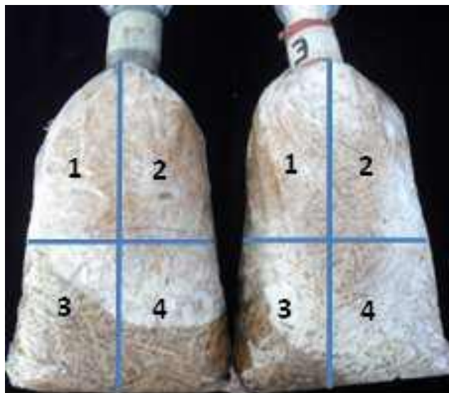
Figure 1. Superficial mycelia colonization in bags with substrate. 1, 2, 3 and 4 represent quadrants for the evaluation of percentage of colonization. Each colonized quadrant represents approximately 12.25% of bag superficial area.

dextrose agar (PDA; Britania ® ) at 4°C.