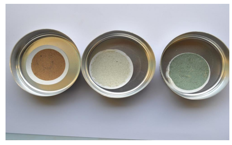
Plate 2. Filtering phytoplankton using 0.45 \mu m pore size Whatman GF/C filter.