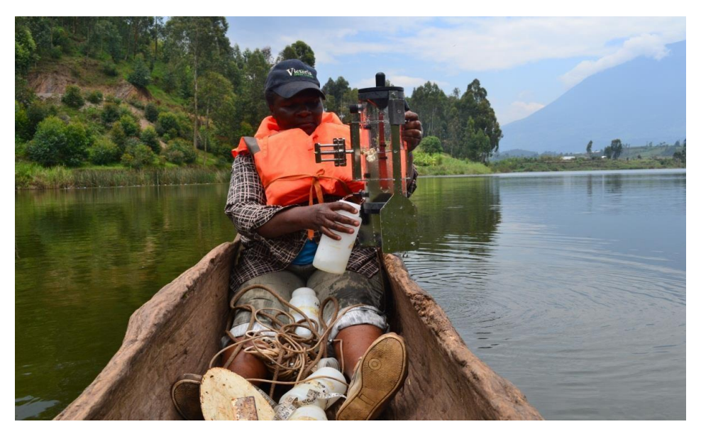
Plate 1. A technician taking water samples on Lake Chahafi in a dug-out canoe.