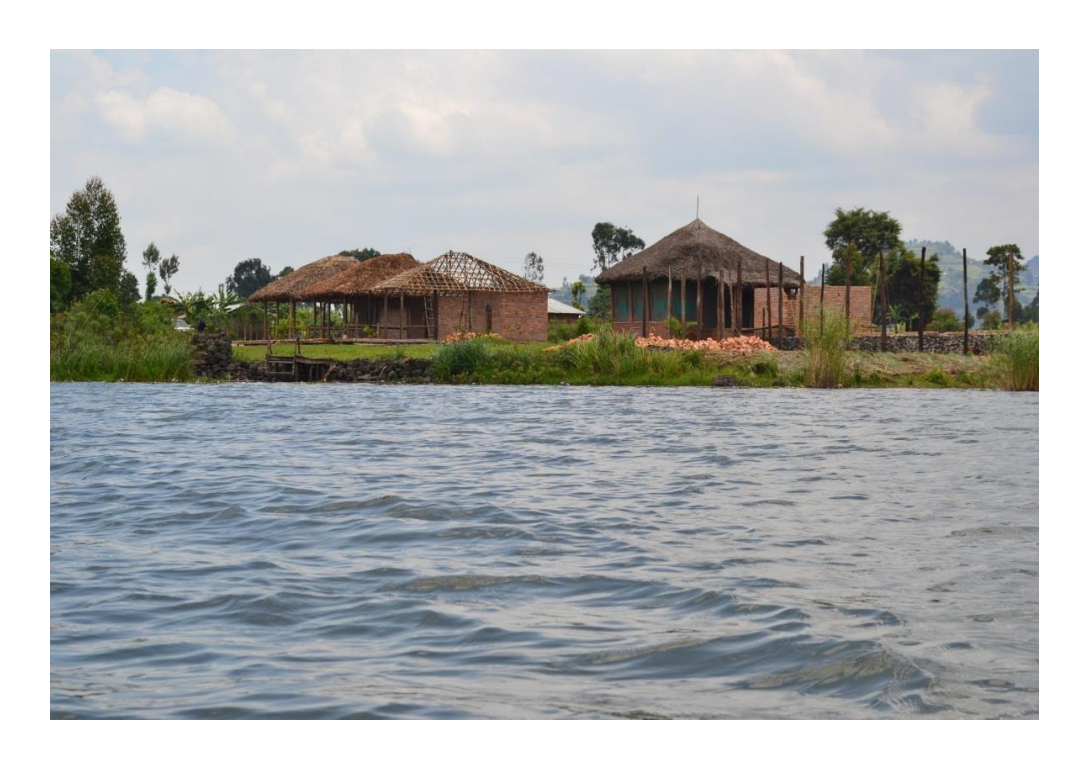
Plate 4. Construction of a new hotel on Lake Mutanda (Author's picture).

changes in the environment/pollution (Elias et al., 2014). Furthermore, Kaul and Pandit (1981) stipulate that the presence of macro-invertebrate species indicates the suitability of the environment for its growth and development, and the absence of any species does not necessarily indicate the unsuitability of the environment, but, the absence of an entire group/order of species indicates adverse environmental conditions for instance pollution.