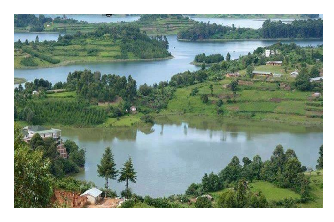
Plate 3. Lake Bunyonyi and developments thereon (Author's picture).

Green (1976), have not been encountered in the current study.