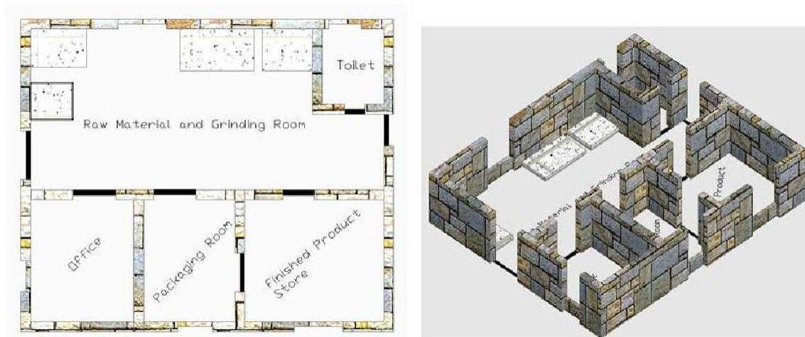
Figure 1: 4 rooms and a toilet building for a small scale Tomato Processing centre

Note: The cost of water was excluded and without the building cost, the total cost estimate will be ₦1, 367,500. The estimate in the table above is a rough estimate.