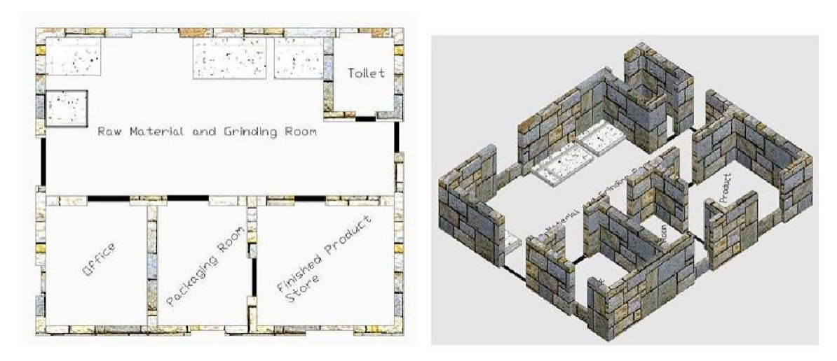
Figure 1: 4 rooms and a toilet building for a small scale Tomato Processing centre

Note: The cost of water was excluded and without the building cost, the total cost estimate will be №1, 367,500. The estimate in the table above is a rough estimate.