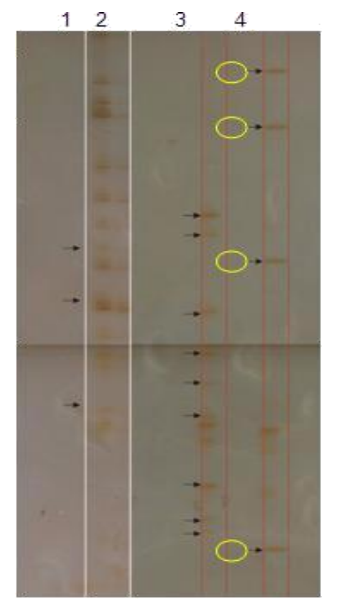
Figure 1. Separation of fragments by the technique of cDNA-AFLP in polyacrylamide gel 6%. Groove: 1 - SCSBRS Tio Taka at 25°C, 2 - SCSBRS Tio Taka at 13°C, E-ACC/M-CAT primers. Groove: 3 - BRS Firmeza at 25°C, 4 - BRS Firmeza at 13°C, E-AAG/M-CTT primers.

(dNTPs) and the enzyme reverse transcriptase. The subsequent synthesis of the second strand of cDNA was performed in a reaction containing a dNTP mix, DNA ligase enzymes, DNA polymerase and RNase, and after that, with T4 DNA polymerase. For cDNA isolation, 0.5 M EDTA, phenol: chloroform: isoamyl alcohol 25:24:1, ammonium acetate 7.5 M and ethanol in order to obtain cDNA intact and free from contamination. The pellet obtained was dissolved in 6 \mu l of DEPC water.