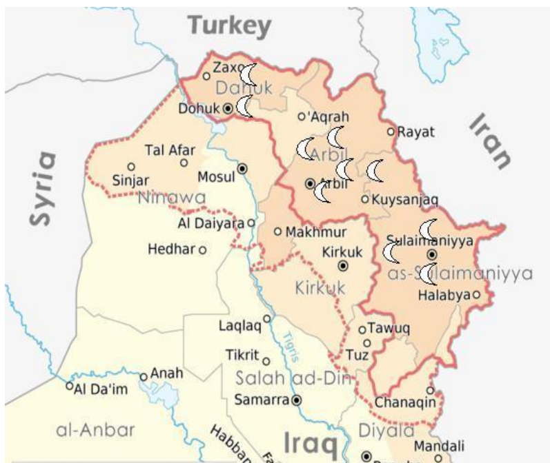
Figure 2. Sketch map of the area under study.