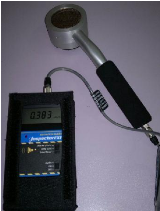
Figure 1. Survey radiation dosimeter used to measure rate of exposure ( \mu\text{Sv/h} ). ( \mu\text{Sv/h} ).

(David and Eric, 2007; Annals of the ICRP, 2011). The actual leakage radiation depends on the system, the tube output and the presence of scattering material (such as a patient) within the gantry. Legislation in different countries restricts the leakage radiation at one meter distance from the tube when operating at maximum high voltage and corresponding tube current (Annals of the ICRP, 2011; Sasa et al., 2003).